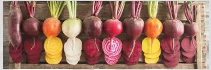
Turnips: Hirosaki Red, Purple Top White Globe

Beets: Touchstone Gold, Early Tall Top Wonder, Ace, Boldor